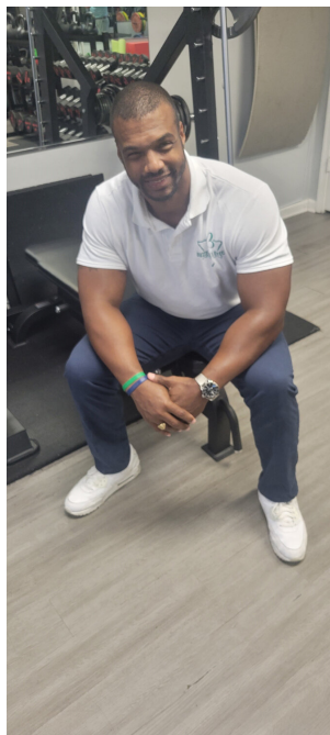
( https://beta.creativecirclecdn.com/delmar/original/20240724-135439-28d-cn%20Butterfly%20cancer2.jpg )